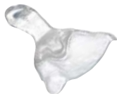
Individual impression tray Material: IMPRELON® (clear or opaque)