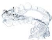
IST®-Appliance Material: DURAN®